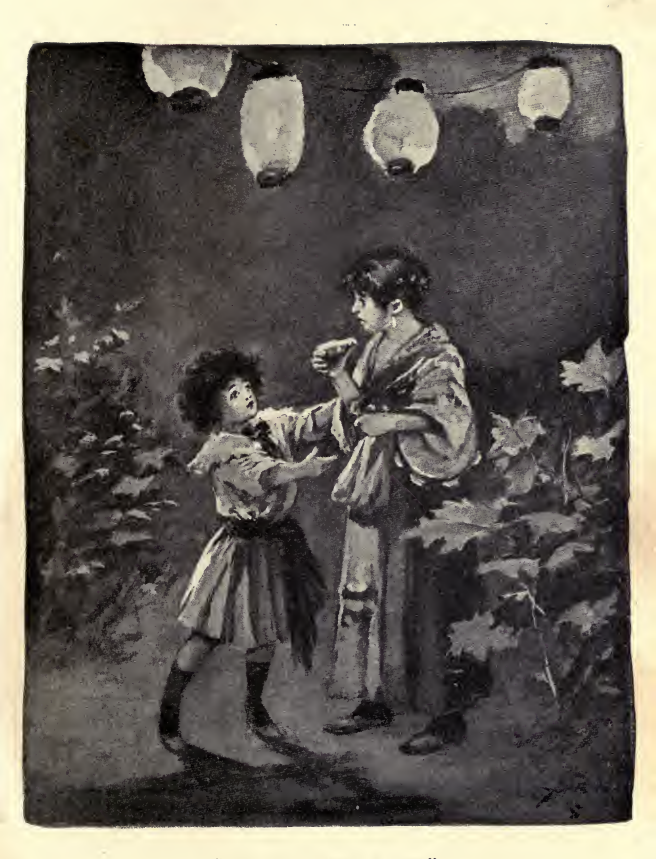
"THE GIRL STARED AT HIM"